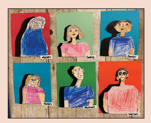
Students in Grade 3 studied cast shadows while creating their own self-portraits.