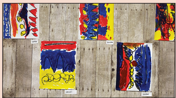
Students in Kindergarten explored line and color while creating these Primary colored pieces. Using paint sticks, they were able to practice Line and Color.