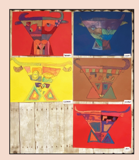
Students in Grades 2 and 4 studied Pablo Picasso and the symbolism of the Bull. Using shapes, color and the idea of cubism students put together their own Picasso inspired Bull drawings.