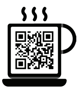
SCAN ME Want to read the poems and enjoy the illustrations in close-up photos? Find a comfortable spot, grab a warm beverage and click the mug QR Code!