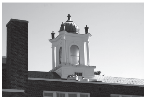
A newly refurbished cupola sparkles atop the school building.