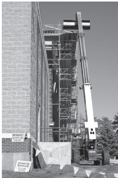
The limestone exterior of the school building was refurbished, a very time consuming project.

One of the most time consuming parts of the facility improvement project was the cleaning and repointing of the joints in the exterior limestone façade of the building. Without proper maintenance over the years, water infiltrates cracks in the limestone, which through summer heat and winter freezing compromises the integrity of the structure. The entire limestone exterior of the school building was