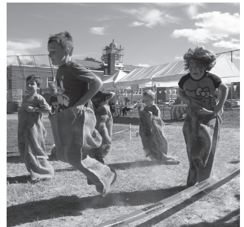
Students compete in sack races at the Kick Off Carnival.