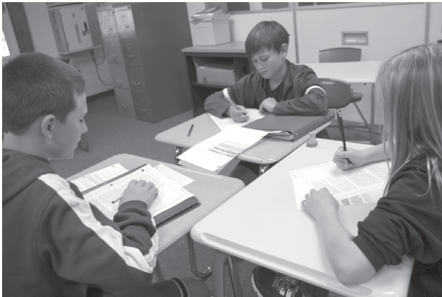
Students in English Language Arts work on a project.