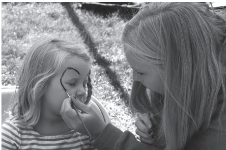
Face painting was a popular activity at the carnival.

"All funds raised from the carnival go toward all of our other programs that we offer throughout the year, such as the Fall Festival, BEST Program, Post-Prom Party, Senior Scholarship, and Camperships."