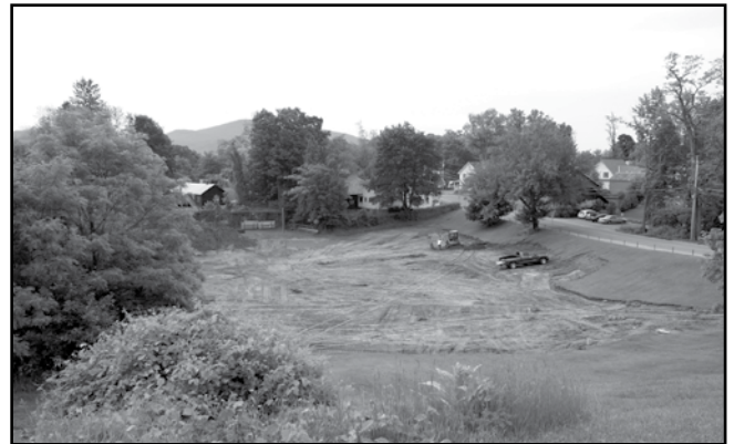
Sod will be placed on top of the newly refurbished level playing surface. The new soccer surface will compliment the existing baseball diamond allowing multiple activities to return to this field.

Originally in 2007-08, voters in the Bolton Central School District approved funds to be added to the budget to renovate the lower athletic field. At the same time, the Facilities Committee was also discussing other district needs. In 2008-09, the Facilities Committee began the process to get approval to replace the roof on the original 1928 portion of the school building, along with other infrastructure work.