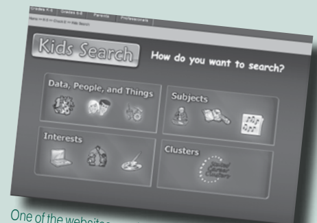
One of the websites used with younger students to build awareness of different careers.

Sharing stories from "Journeys to Jobs," playing Career BINGO,