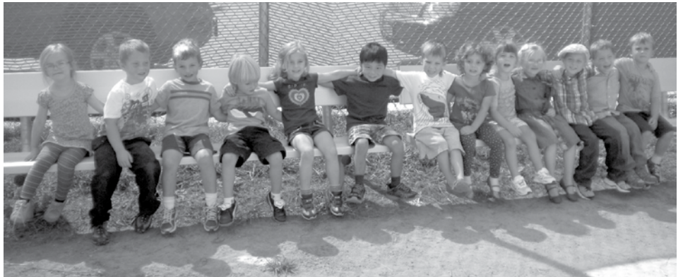
This year's pre-kindergarten class at Bolton Central School will be the graduating class of 2027.

Bolton Central School will hold its annual pre-kindergarten and kindergarten student registration from 8:30 a.m. to 2:30 p.m. on Wednesday, May 1.