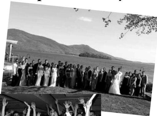
Scenes from last year's prom which was also held at The Sagamore.