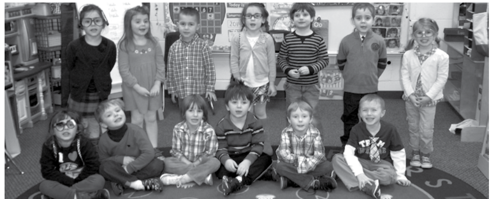
The Class of 2028 poses for Geek Day in pre-kindergarten class.

I like to read. My favorite book that I read for pleasure is "Catching Fire" and that's my favorite movie, too.