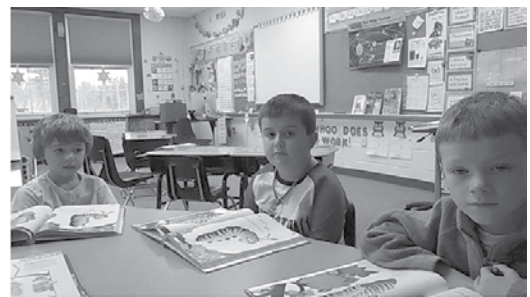
First grade students answer questions during guided reading.