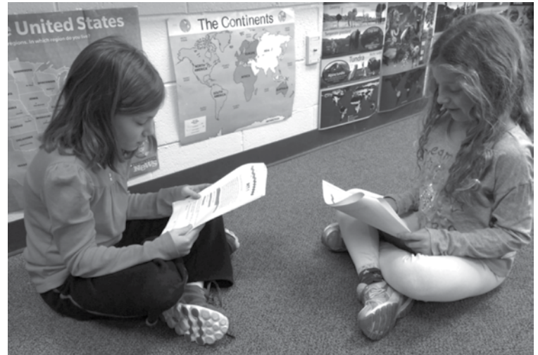
Second graders practice their reading with each other in a buddy-reading session.