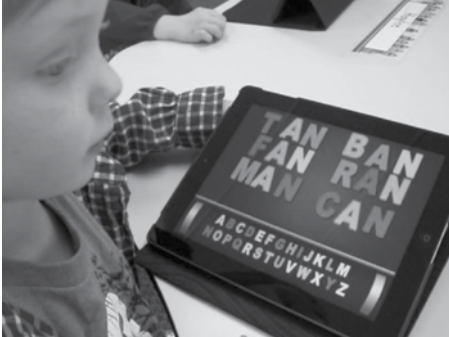
A pre-kindergarten student uses an iPad to make rhyming words fun.

We take the process of reading for granted forgetting all the steps it took before reading became second nature. To create a lifelong learner and instill the love of reading, it requires an early start for students.