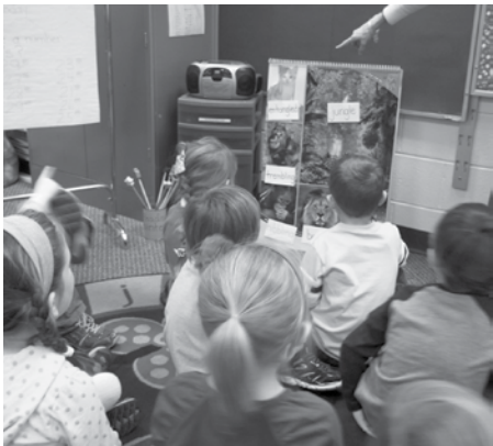
Kindergarteners review words that are used in their weekly literacy book.