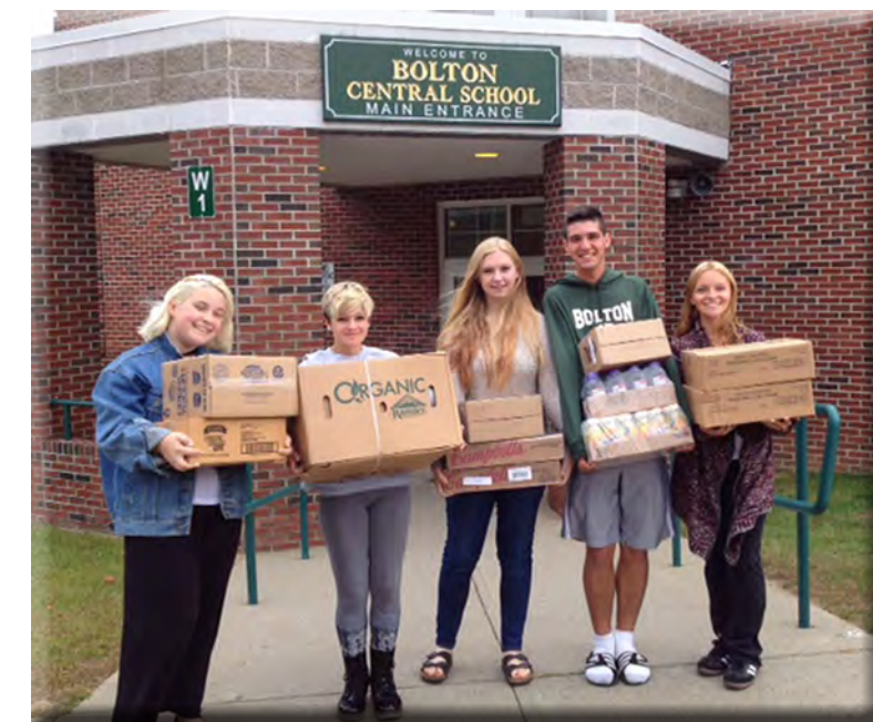
Key Club members help carry cartons for the Backpack Program