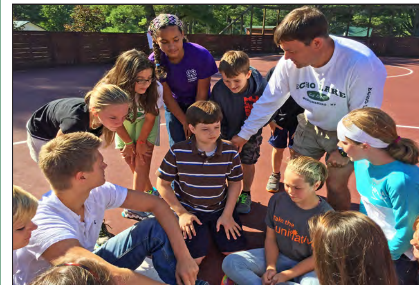
The Peer Mentoring Program held a Fall Leadership Training at Camp Echo Lake at the beginning of the school year.