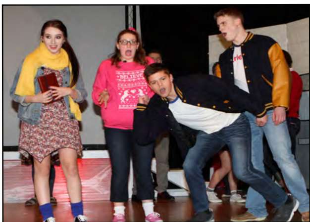
Bullying anyone is always disrespectful

We all know this phrase - -we most often hear it from a friend, family member, parent or teacher when there is something important to discuss, even if talking about it makes us uneasy. That was the message of the Bolton Drama Club's performance of Seventeen this spring. On one hand, Seventeen is an over the top look at high school insiders, outsiders, and cliques "mean girls." On another it is a sensitive look at teen suicide, and a reminder that "we need to talk" about one of the most troubling problems facing today's teenagers. The decision to address this topic as a high school drama production was not an easy one.