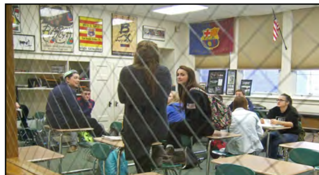
BCS Juniors during a Friday Olweus committee meeting

Together, we can all take steps to make sure our school is a safe place where everyone in our community can be a resource for those in times of need.